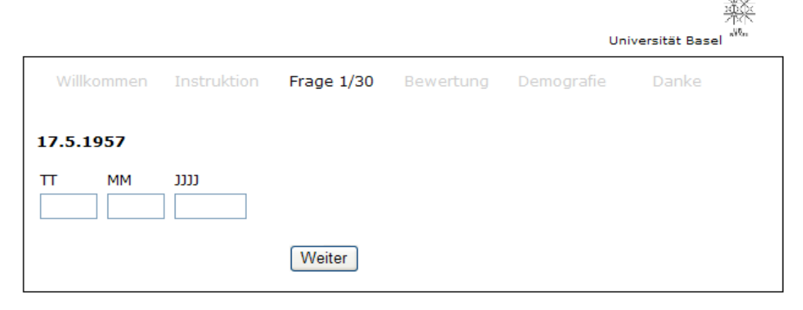
Figure 5 . Example on how the task was presented to the user.

The task for participants was to fill in the date presented into the input field as fast as possible and to click on the button to proceed to the next screen. In line with the stated format requirements, dates had to be entered using two digits for the day and the month and four digits for the year. At the end, a post-test questionnaire appeared with each condition presented again on the same screen and the questions "Filling in the date was comfortable" and "I could fill in the date quickly and efficiently" were placed under each condition. Subjects had to rate these two questions for each condition on a six-point Likert-scale. Finally, participants were asked for their age and gender and thanked for their participation.