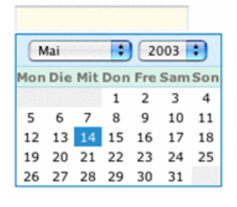
Figure 4. Condition 5 and 6 of the independent variable: Input types for date entries.

Version 6 (calendar): A calendar pops-up when the icon right to the input field is clicked.